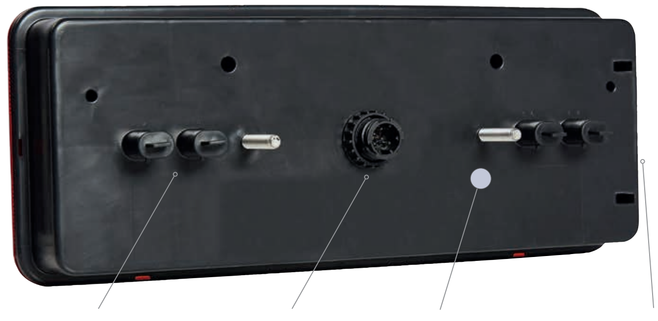
Super Seal connection: 3 x position incl. SIMAC® 1 x reverse (L) & stop (R)