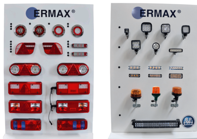
Type 2 - 009 100 142