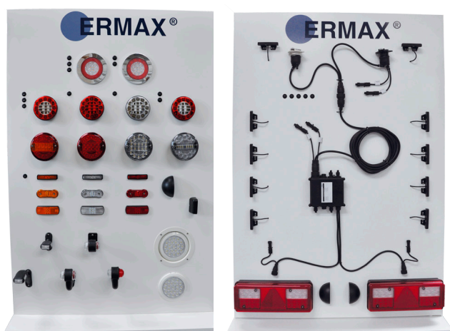
Type 1 - 009 100 140